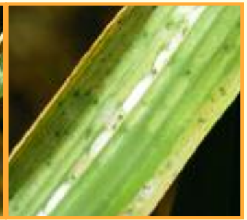
Spider mite web

☑ SEEING YELLOW? STAY MELLOW! It's perfectly normal to see lots of yellow leaves show up in early summer as bamboo begins shedding old leaves. Watch for the new leaf buds to unfurl.