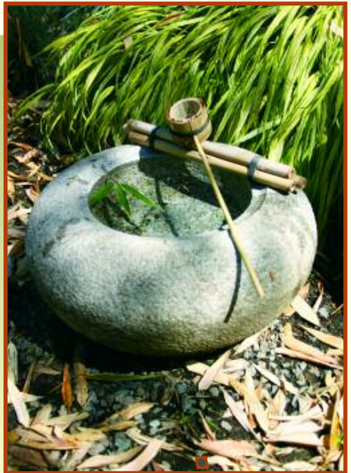
Tetsubachi basin and ladle

Granite: Looking to add traditional elements of stone and water to a small garden or along a woodland path? The simplicity of the Tetsubachi basin is my favorite way to add elegance amid a mass of foliage. You can dress it up with a bamboo ladle for a more Asian flair. ■