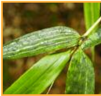
Mold from aphid residue